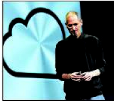
HIS VISION IS NOT CLOUDED: Steve Jobs

Apple is trying to parlay the success of the iPhone and